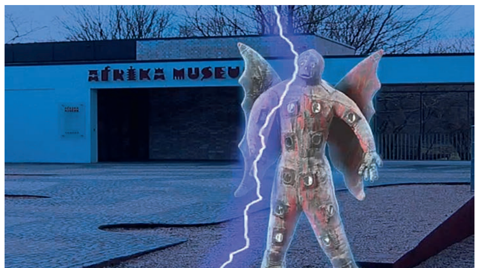
15 One of one of the Afrika Museum's television commercials for its 2009 exhibition on the religions of the African diaspora, Roots and More: Reis van dees gessen [Journey of the Spirits]. This ad represents a winged, saber-wielding Bizango bounding out with a flash, like Batman, to invite visitors on a journey with the Vodou spirits.