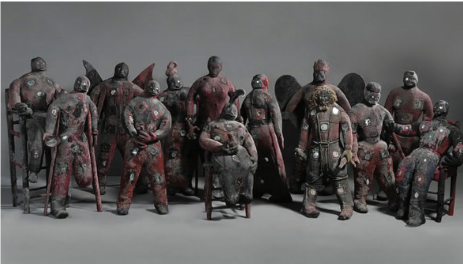
16 Afrika Museum's Bizango installation (early 2000s, artist "unknown" although it is Dubréus Lhérisson's work). This installation was titled The Night Watch , after one of Rembrandt's most famous paintings (see Figure 17).