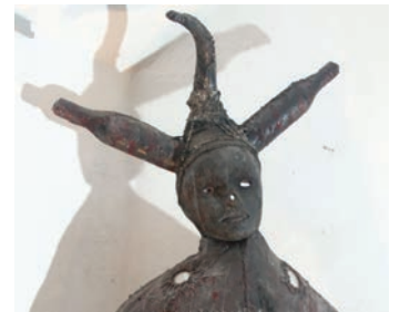
(right) 2a–b Unknown artist The Bizango Empress (early 2000s) Padded fabrics, bones, teeth, wood, mirrors, metal, plastic. H: 137 cm

purposes? Is the distinction between a ritual object and an art object as clear as all that? What do we know about the secret societies they are supposed to have come from? What can they tell us about new attempts to institutionalize Vodou and transform it into “heritage”?