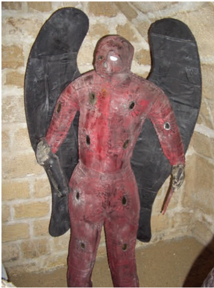
(counterclockwise from left) 11 One the Bizango statues held by Galerie Vibrations, Paris, April 2010.