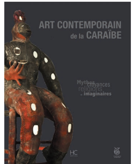
13 Dubréus Lhérisson's work Bizango Mèt Bitasyon makes the cover of a luxurious contemporary art book edited by Renée-Paule Yung-Hing, Art contemporain de la Caraïbe. Mythes, croyances, religions et imaginaires (Paris: Éditions Hervé Chopping, 2012). Bizango Mèt Bitasyon is dated 2006 and is part of the collection of the Ateliers Jérôme in Port-au-Prince (Haiti).